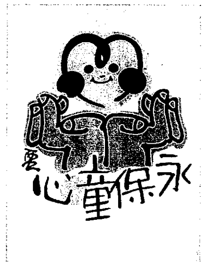
款式 B 圖案 Icon on type B